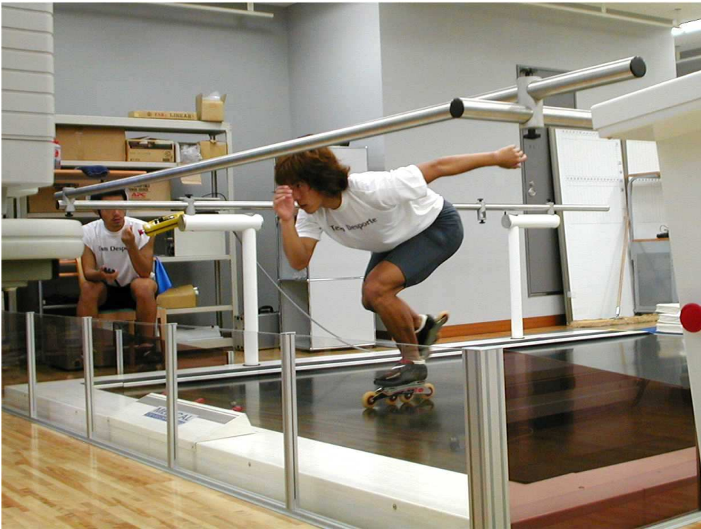
S3040 installation in Tokyo