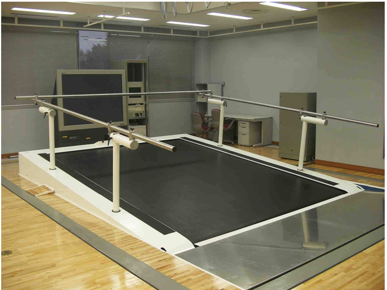
S3040 treadmill developed and manufactured for Japan Institute of Sport Sciences (JISS) – TOKYO

Very large treadmills : S3040 Very large Running area 3m/4m Speed : 0 à 60 km/h ; Slope : - 10% à + 25%